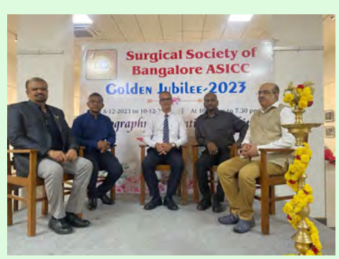
PHOTOGRAPHY AND PAINTING EXHIBITION 08 to 10, Dec-2023