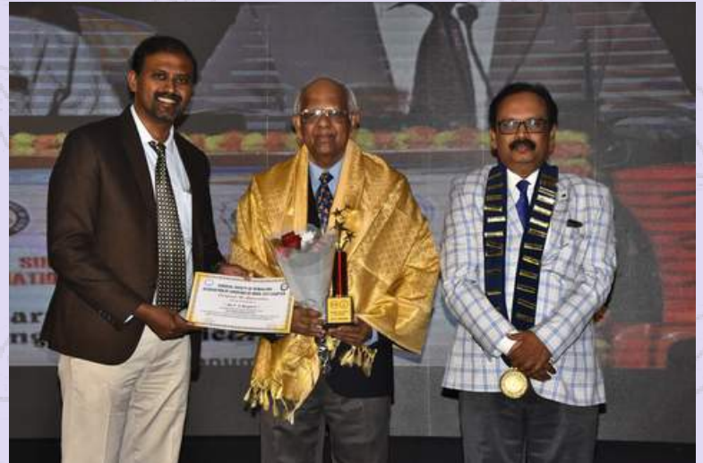
Honouring the Quiz Master